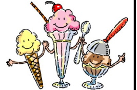
Ice Cream Social