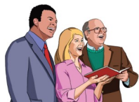
Sing With Us